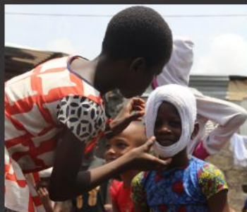
Emergency Preparedness Education for Children