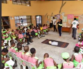
First Aid Education for Children