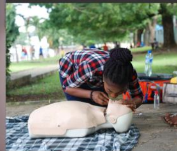
Public Health and Safety Advocacy