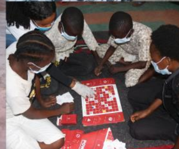
Safety Education for Children