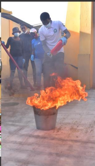
Public Event Safety